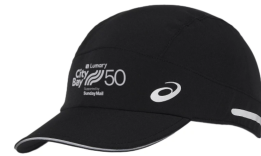
ASICS Running Hat