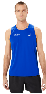
ASICS Mens Singlet