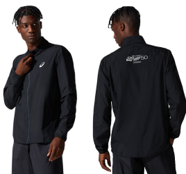
ASICS SILVER JACKET