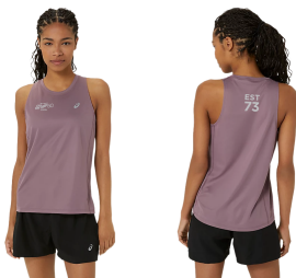
ASICS SILVER TANK