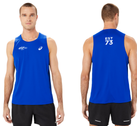
ASICS SILVER SINGLET